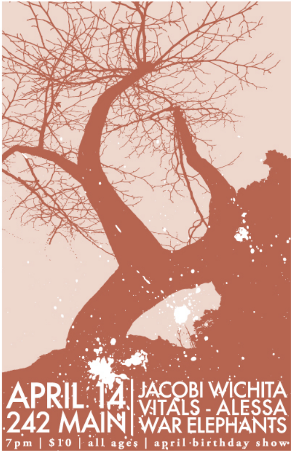
Digital bild- Exempel på olika flyers